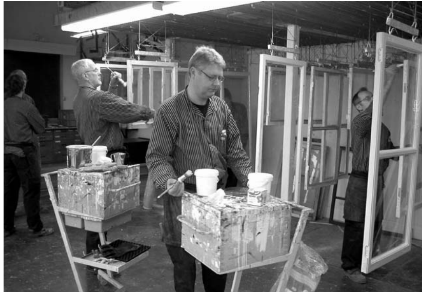
Figure 4 Students at Bjäresjö School, Ystad learning how to use solvent-free linseed-oil paint manufactured by local raw flax material.